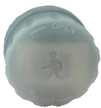
Microwave Motion Sensor HB006