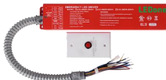
Emergency Driver LOC-EMDR-25WHV