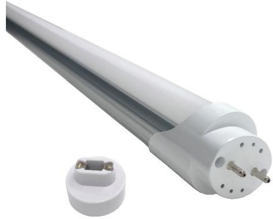
G13 base with R17D end cap