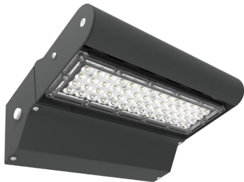
40W or 60W