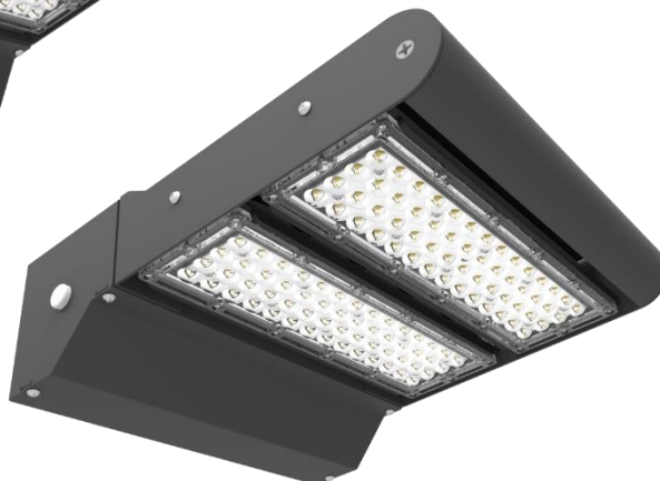
90W or 120W