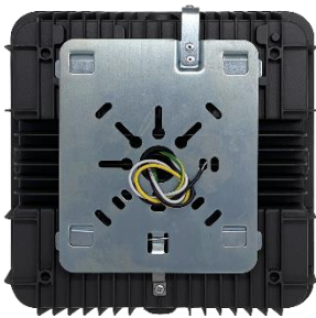
Wall Mounting Quick Mount Back Plate

TEST BUTTON: For models with emergency battery pre-installed